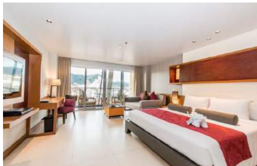
DELUXE ROOM KING BED