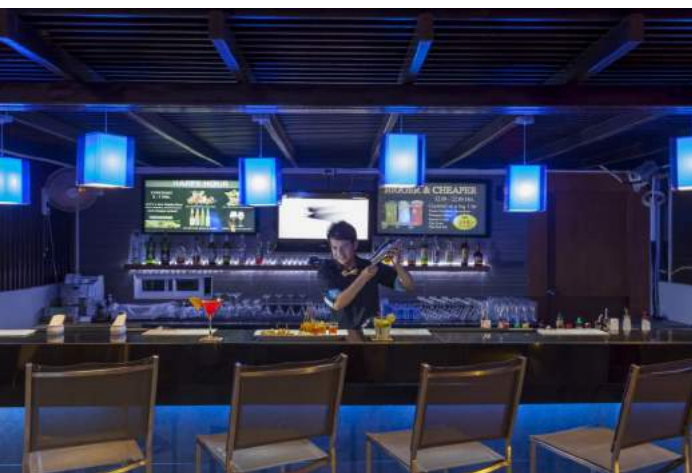
AIR ROOFTOP BAR & LOUNGE