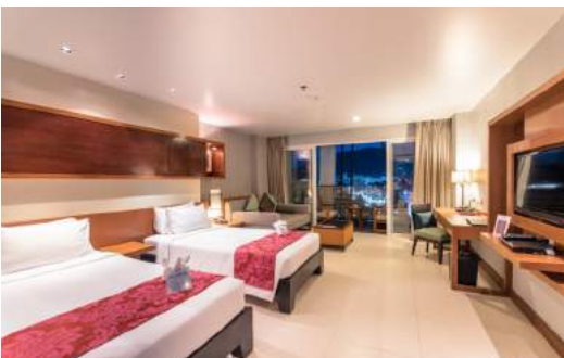
DELUXE ROOM TWIN BED